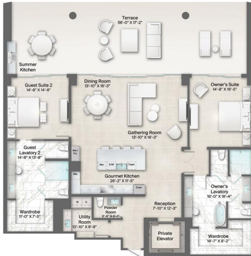
Terrace square footage varies by Residence